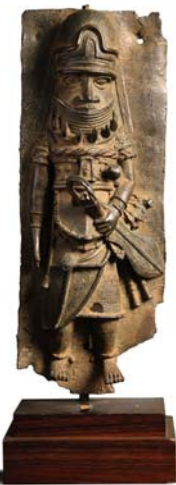
Benin Bronze Plaque of an Oba , Nigeria (est. $200/300,000)

Three bronze plaques from the Kingdom of Benin, cast in the cire perdue technique and dating to the 16 th or 17 th Centuries, will also be offered for sale. The most important in the group portrays an Oba (King) of Benin, wearing his battle armor (est. $200/300,000). Previously in the collection of the British Museum, it was purchased in 1957 from the Klejman Gallery in New York.