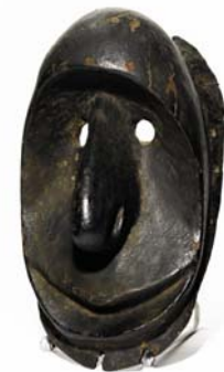
Vanuatu (New Hebrides) Mask (est. $30/50,000)

Chaim Gross (1904-1991) was a leading sculptor of early 20th Century American art. He was especially known for his direct carving technique, creating a world of playful acrobats, mothers and children from raw logs of wood and blocks of stone. He began drawing at an early age and throughout his life produced a prodigious number of graphic works, many of which were preparatory studies for his sculptures. Later in his career, he worked on sculptures modeled in clay or plaster for casting in bronze. While Gross worked with multiple media, his first passion lay in wood carving, often choosing the hardest woods available, such as lignum vitae and ebony. As a wood carver, the African forms and craftsmanship that Chaim Gross admired were integrated into the psyche of his own work, and like many of his African counterparts, Gross crafted each of his works from a single log of wood.