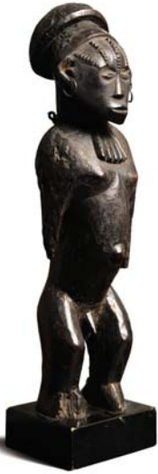
Ngbaka Male Ancestor Figure , Ubangi region, Democratic Republic of the Congo (est. $400/600,000)

Another great highlight is a Ngbaka Male Ancestor Figure , from the remote Ubangi region of the Democratic Republic of the Congo (est. $400/600,000), which Gross purchased directly from Frank Crowninshield and was first exhibited in the 1937 Brooklyn Museum exhibition African Negro Art from the Collection of Frank Crowninshield . The figure, which has been widely published and acclaimed as the best-known example of its kind, is set on a base crafted by Japanese woodworker Inagaki, who worked in Paris during the 1920s and 1930s; presumably Crowninshield or Graham purchased the piece in Paris during that time.