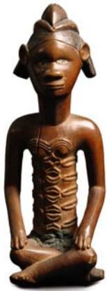
Bembe Seated Male Figure, Democratic Republic of the Congo (est. $50/70,000)

Two Fang Male Reliquary Figures from Gabon, estimated at $150/250,000 and $250/350,000, will also be featured. Modern artists such as Picasso and his contemporaries were most fascinated with Fang figures, which incorporate a cubist deconstruction and abstraction prized among modernists. The Crowninshield provenance of both figures suggests that they were in Paris in the 1920s, and thus at the epicenter of the exchange between African Art and modern artists. The Bembe Seated Male Figure from the Democratic Republic of the Congo was also purchased directly from Crowninshield (est. $50/70,000).