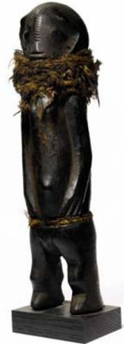
Ngbaka Ancestor Figure , Ubangi region, Democratic Republic of the Congo (est. $100/150,000)

Another great highlight is a Ngbaka Male Ancestor Figure , from the remote Ubangi region of the Democratic Republic of the Congo (est. $400/600,000), which Gross purchased directly from Frank Crowninshield and was first exhibited in the 1937 Brooklyn Museum exhibition African Negro Art from the Collection of Frank Crowninshield . The figure, which has been widely published and acclaimed as the best-known example of its kind, is set on a base crafted by Japanese woodworker Inagaki, who worked in Paris during the 1920s and 1930s; presumably Crowninshield or Graham purchased the piece in Paris during that time.