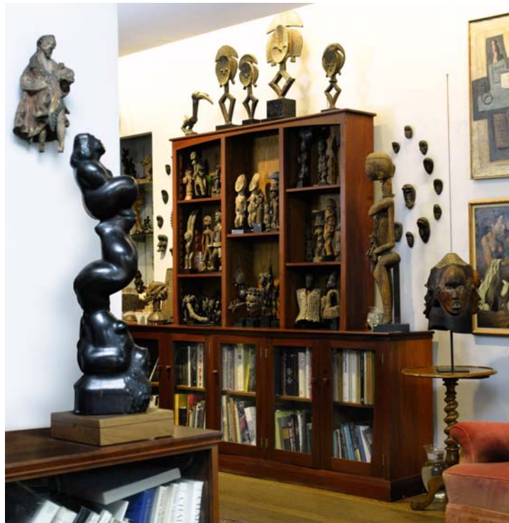
Interior View of the Renee and Chaim Gross Foundation

Sotheby's to Offer African & Oceanic Art from the Collection of The Renee and Chaim Gross Foundation