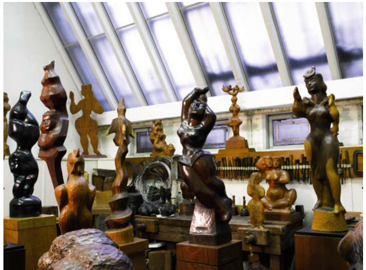
The Chaim Gross Studio

Gross became interested in African Art as a frequent visitor to the city's many museums, especially the Museum of Natural History. He was one of the earliest collectors in the United States, and among the most fervent promoters of African Art. Gross was one of the founders of the Museum of African Art in Washington, D.C., now part of the Smithsonian Institution, which in 1976-77 held an exhibition titled The Sculptor's Eye: The African Art Collection of Mr. and Mrs. Chaim Gross , which subsequently traveled to the Worcester Art Museum, the Cincinnati Museum of Art and the University of Georgia Museum. Gross had a contagious enthusiasm for the works with which he surrounded himself in his Greenwich Village studio and home, located at 526 LaGuardia Place, which today houses the Chaim Gross Studio.