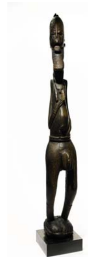
Soninke Hermaphrodite Figure , Mali (est. $400/600,000)

From the western Sudan region is the exceptional Soninke Hermaphrodite Figure from Mali, possibly 12 th to 15 th Century (est. $400/600,000). The figure is a striking image of a human form of both genders with an elongated body, and is one of a small group of works that can be attributed to one anonymous workshop active between the 12 th and 15 th Centuries that was first identified by the Belgian Bernard de Grunne. Other figures by the same workshop are in the Minneapolis Institute of Arts and the collection of Drs. Marian and Daniel Malcolm, New Jersey.