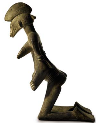
Senufo Kneeling Female Figure , Ivory Coast (est. $250/350,000)

Among the highlights of the collection to be offered is a Senufo Kneeling Female Figure from the Ivory Coast , which measures just eleven inches high (est. $250/350,000). Having been widely exhibited and published, the figure's kneeling posture represents a unique iconography and makes it one of the best-known works from the Gross Collection. The encrusted patina is the result of numerous applications of ritual offerings and attests to the sculpture's great age. Gross purchased the figurine privately in the late 1950s from Merton D. Simpson, who would later in the 1960s and 1970s become one of the most prominent international dealers in the field.